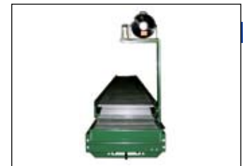
Fan and Light