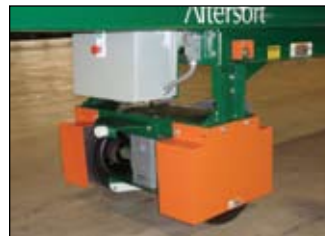
Changeable Drive System